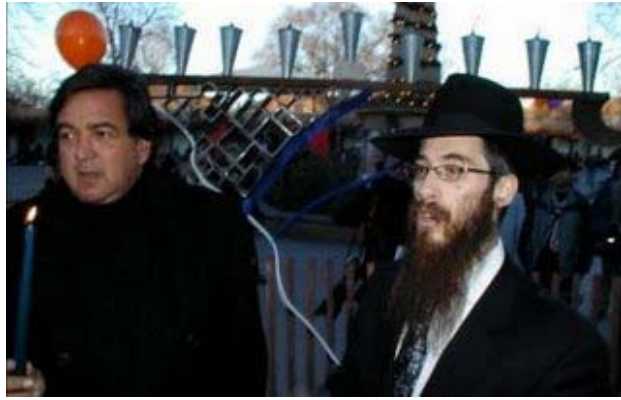
Governor of New Mexico, William Blaine 'Bill' Richardson

... with yet another member of the Chabad Lubavitch.